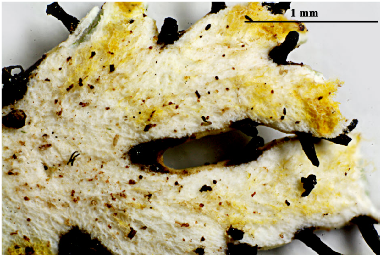
Heterodermia apicalis sp. nov.